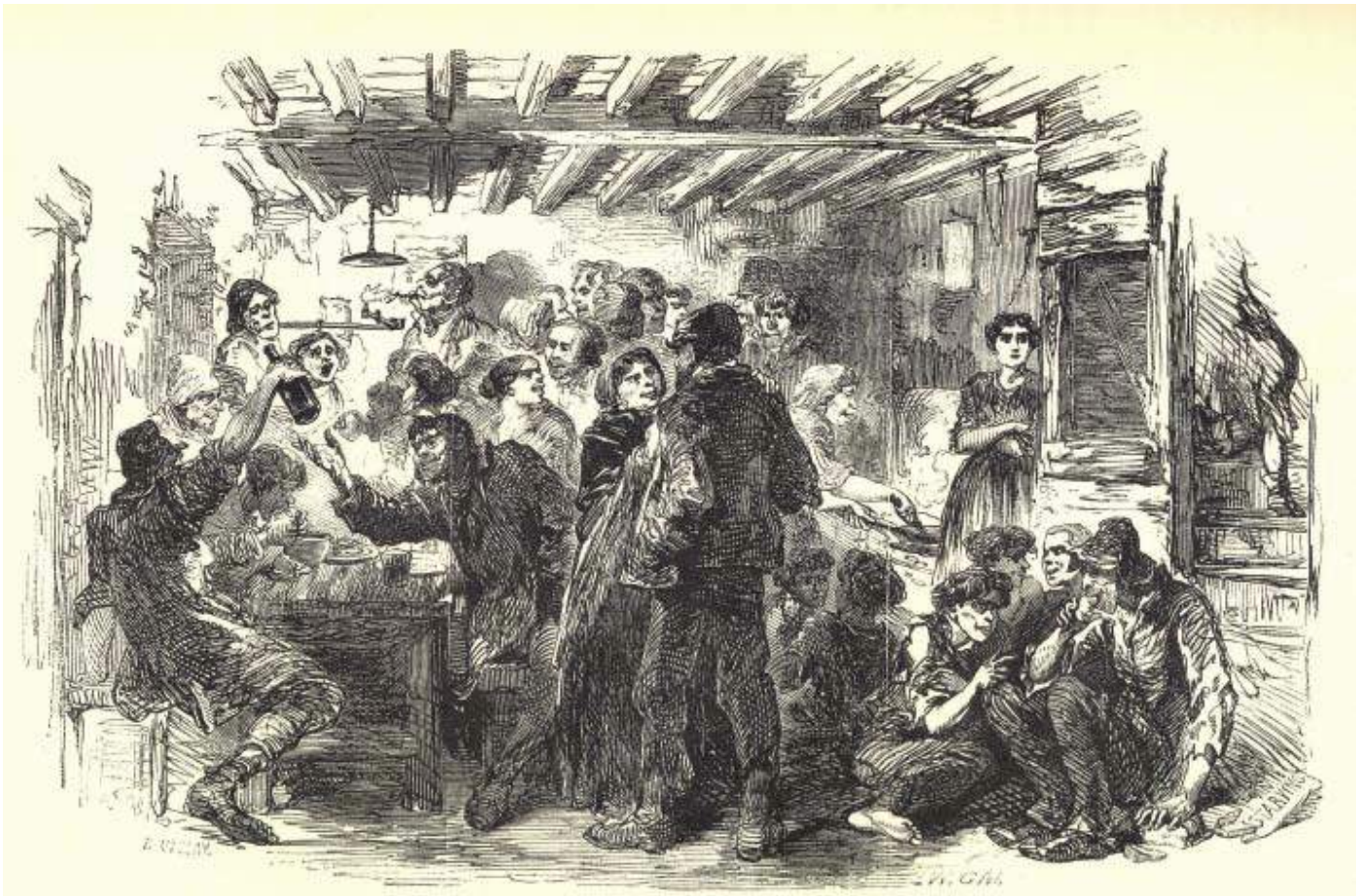
Fig. 1 – The London poor in the mid-nineteenth century as seen by a contemporary.

From: Henry Mayhew, London Labour and the London Poor , 1861.