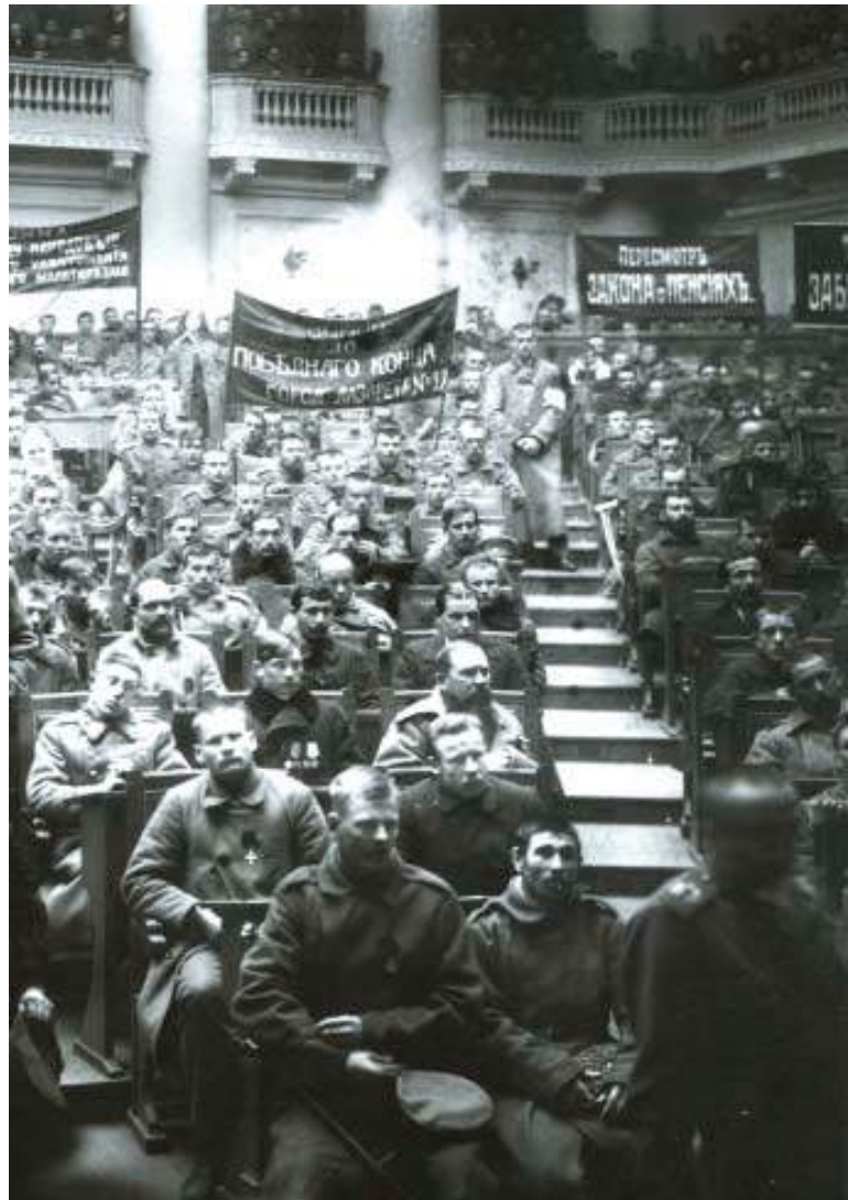
Fig.8 – The Petrograd Soviet meeting in the Duma, February 1917.

On Sunday, 25 February, the government suspended the Duma. Politicians spoke out against the measure. Demonstrators returned in force to the streets of the left bank on the 26th. On the 27th, the Police Headquarters were ransacked. The streets thronged with people raising slogans about bread, wages, better hours and democracy. The government tried to control the situation and called out the cavalry once again. However, the cavalry refused to fire on the demonstrators. An officer was shot at the barracks of a regiment and three other regiments mutinied, voting to join the striking workers. By that evening, soldiers and