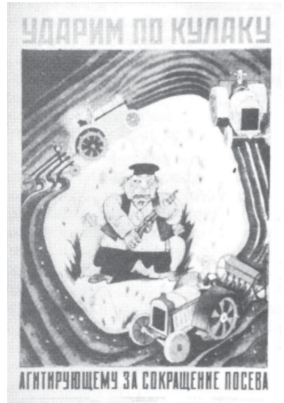
Fig. 18 – A poster during collectivisation. It states: ‘We shall strike at the kulak working for the decrease in cultivation.’

Exiled – Forced to live away from one’s own country.