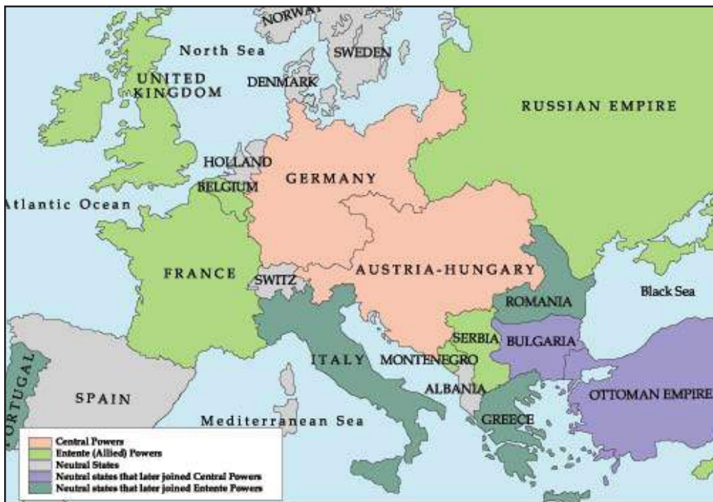
Fig.4 – Europe in 1914.

The map shows the Russian empire and the European countries at war during the First World War.