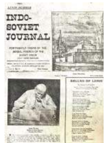
Fig. 20 – Special Issue on Lenin of the Indo-Soviet Journal. Indian communists mobilised support for the USSR during the Second World War.