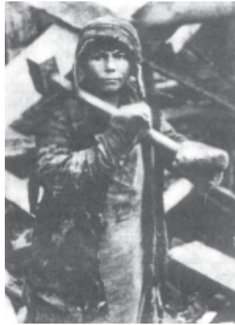
Fig. 16 – A child in Magnitogorsk during the First Five Year Plan. He is working for Soviet Russia.