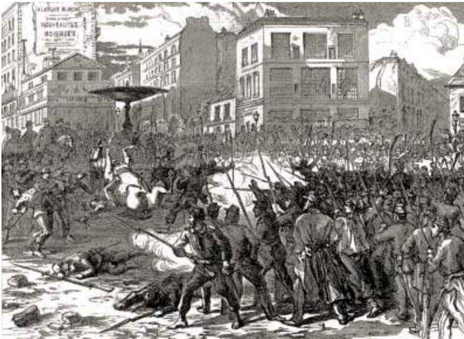
Fig.2 – This is a painting of the Paris Commune of 1871. It portrays a scene from the popular uprising in Paris between March and May 1871. This was a period when the town council (commune) of Paris was taken over by a ‘peoples’ government’ consisting of workers, ordinary people, professionals, political activists and others. The uprising emerged against a background of growing discontent against the policies of the French state. The ‘Paris Commune’ was ultimately crushed by government troops but it was celebrated by Socialists the world over as a prelude to a socialist revolution. The Paris Commune is also popularly remembered for two important legacies: one, for its association with the workers’ red flag – that was the flag adopted by the communards (revolutionaries) in Paris; two, for the ‘Marseillaise’, originally written as a war song in 1792, it became a symbol of the Commune and of the struggle for liberty.