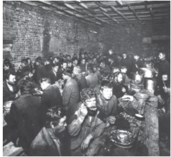
Fig.5 – Unemployed peasants in pre-war St Petersburg.

In the countryside, peasants cultivated most of the land. But the nobility, the crown and the Orthodox Church owned large properties. Like workers, peasants too were divided. They were also