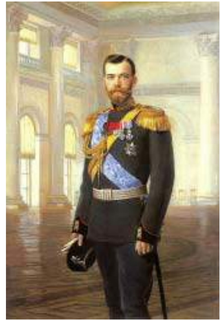
Fig.3 – Tsar Nicholas II in the White Hall of the Winter Palace, St Petersburg, 1900. Painted by Earnest Lipgart (1847-1932)

In 1914, Tsar Nicholas II ruled Russia and its empire. Besides the territory around Moscow, the Russian empire included current-day Finland, Latvia, Lithuania, Estonia, parts of Poland, Ukraine and Belarus. It stretched to the Pacific and comprised today's Central Asian states, as well as Georgia, Armenia and Azerbaijan. The majority religion was Russian Orthodox Christianity – which had grown out of the Greek Orthodox Church – but the empire also included Catholics, Protestants, Muslims and Buddhists.