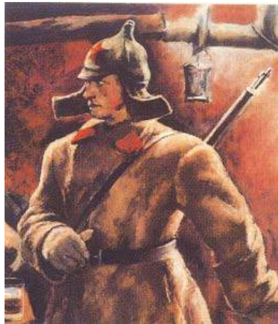
Fig. 12 – A soldier wearing the Soviet hat (budeonovka).

followed, the Bolsheviks became the only party to participate in the elections to the All Russian Congress of Soviets, which became the Parliament of the country. Russia became a one-party state. Trade unions were kept under party control. The secret police (called the Cheka first, and later OGPU and NKVD) punished those who criticised the Bolsheviks. Many young writers and artists rallied to the Party because it stood for socialism and for change. After October 1917, this led to experiments in the arts and architecture. But many became disillusioned because of the censorship the Party encouraged.