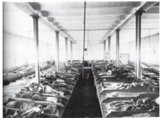
Fig.6 – Workers sleeping in bunkers in a dormitory in pre-revolutionary Russia.

Many survived by eating at charitable kitchens and living in poorhouses.