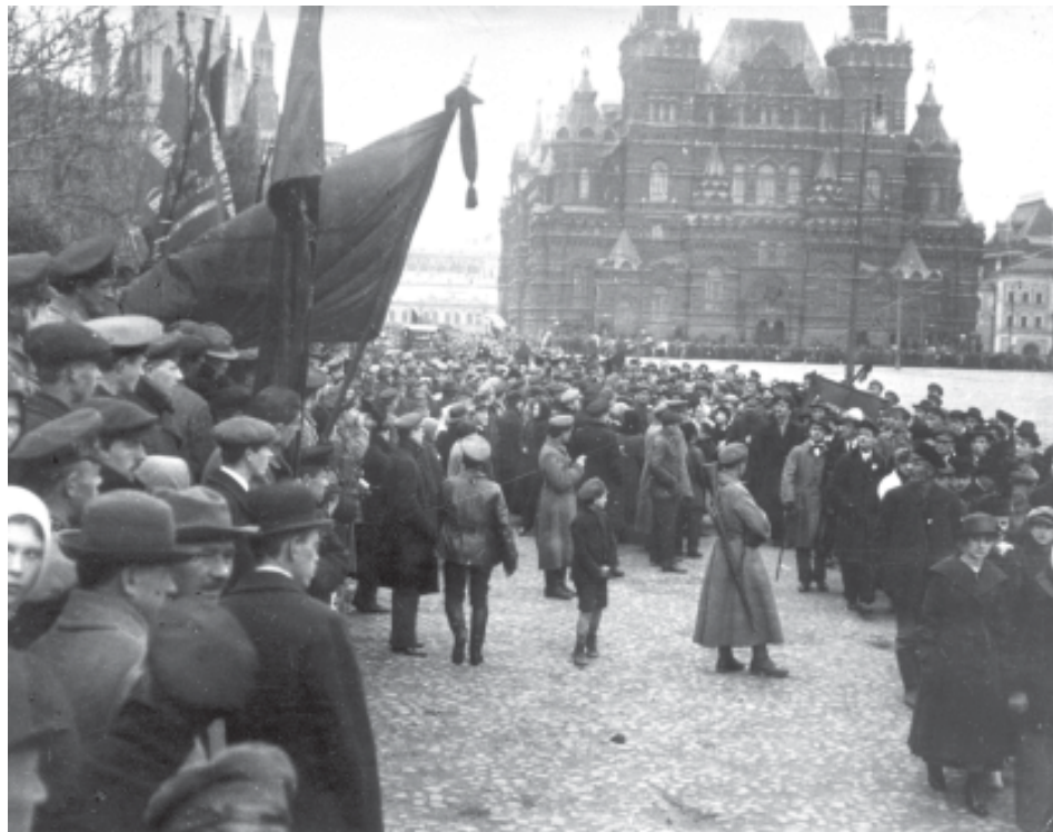
Fig. 13 – May Day demonstration in Moscow in 1918.