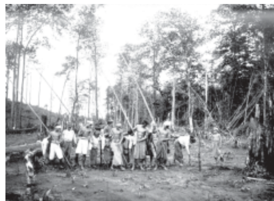
Fig. 15 – Taungya cultivation was a system in which local farmers were allowed to cultivate temporarily within a plantation. In this photo taken in Tharrawaddy division in Burma in 1921 the cultivators are sowing paddy. The men make holes in the soil using long bamboo poles with iron tips. The women sow paddy in each hole.

Children living around forest areas can often identify hundreds of species of trees and plants. How many species of trees can you name?