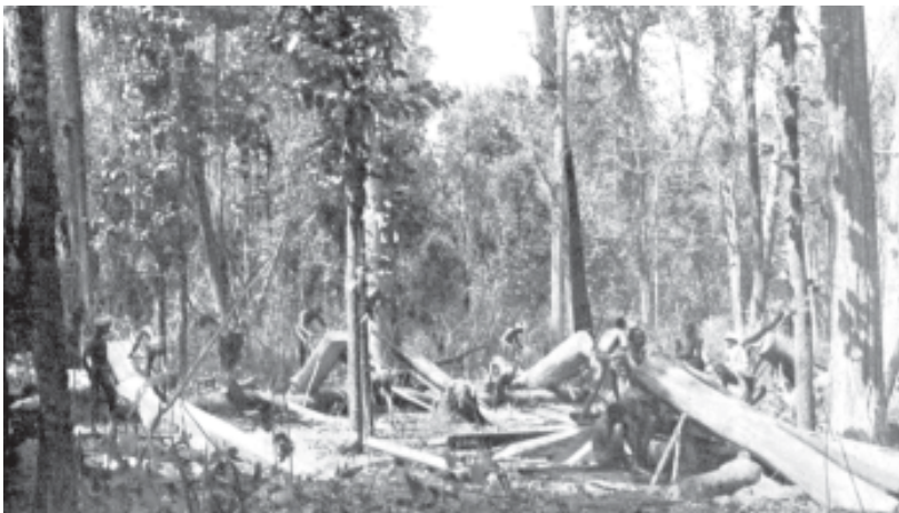
Fig.3 – Converting sal logs into sleepers in the Singhbhum forests, Chhotanagpur, May 1897. Adivasis were hired by the forest department to cut trees, and make smooth planks which would serve as sleepers for the railways. At the same time, they were not allowed to cut these trees to build their own houses.