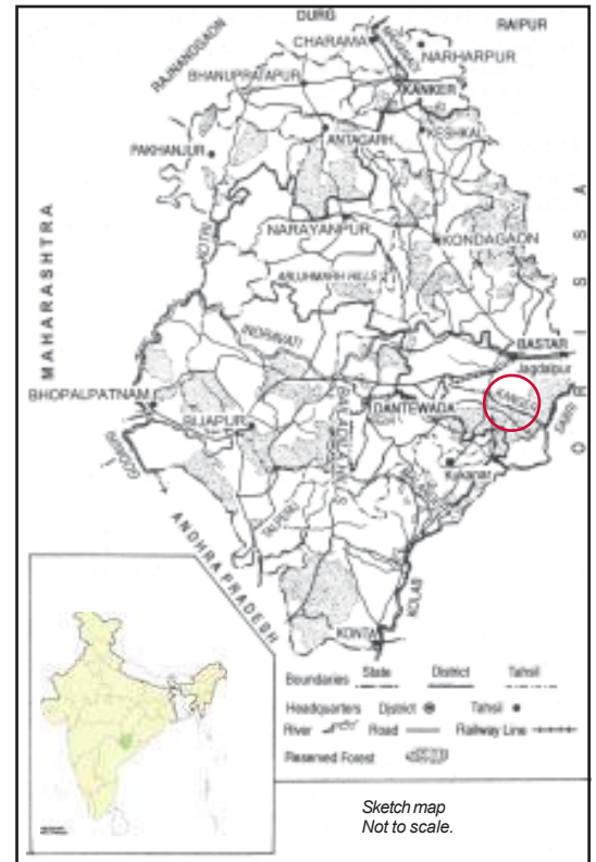
Fig.20 – Bastar in 2000.

Bastar is located in the southernmost part of Chhattisgarh and borders Andhra Pradesh, Orissa and Maharashtra. The central part of Bastar is on a plateau. To the north of this plateau is the Chhattisgarh plain and to its south is the Godavari plain. The river Indrawati winds across Bastar east to west. A number of different communities live in Bastar such as Maria and Muria Gonds, Dhurwas, Bhatras and Halbas. They speak different languages but share common customs and beliefs. The people of Bastar believe that each village was given its land by the Earth, and in return, they look after