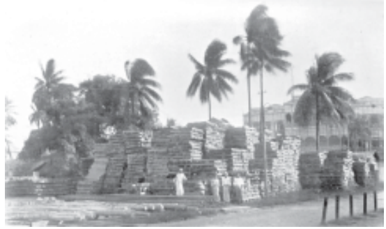
Fig.23 – Indian Munitions Board, War Timber Sleepers piled at Soolay pagoda ready for shipment, 1917.

Since the 1980s, governments across Asia and Africa have begun to see that scientific forestry and the policy of keeping forest communities away from forests has resulted in many conflicts. Conservation of forests rather than collecting timber has become a more important goal. The government has recognised that in order to meet this goal, the people who live near the forests must be involved. In many cases, across India, from Mizoram to Kerala, dense forests have survived only because villages protected them in sacred groves known as sarnas , devarakudu , kan , rai , etc. Some villages have been patrolling their own forests, with each household taking it in turns, instead of leaving it to the forest guards. Local forest communities and environmentalists today are thinking of different forms of forest management.