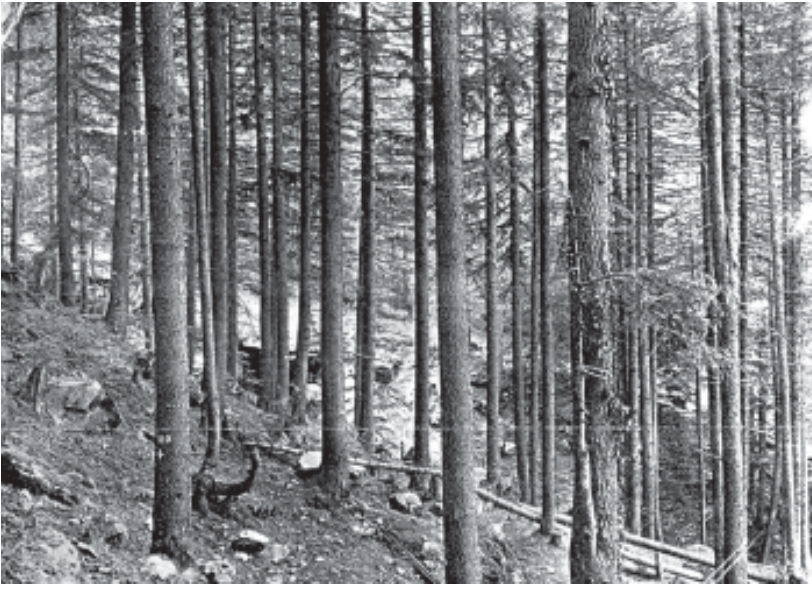
Fig. 10 – A deodar plantation in Kangra, 1933. From Indian Forest Records , Vol. XV.

punished. So Brandis set up the Indian Forest Service in 1864 and helped formulate the Indian Forest Act of 1865. The Imperial Forest Research Institute was set up at Dehradun in 1906. The system they taught here was called ‘ scientific forestry ’. Many people now, including ecologists, feel that this system is not scientific at all.