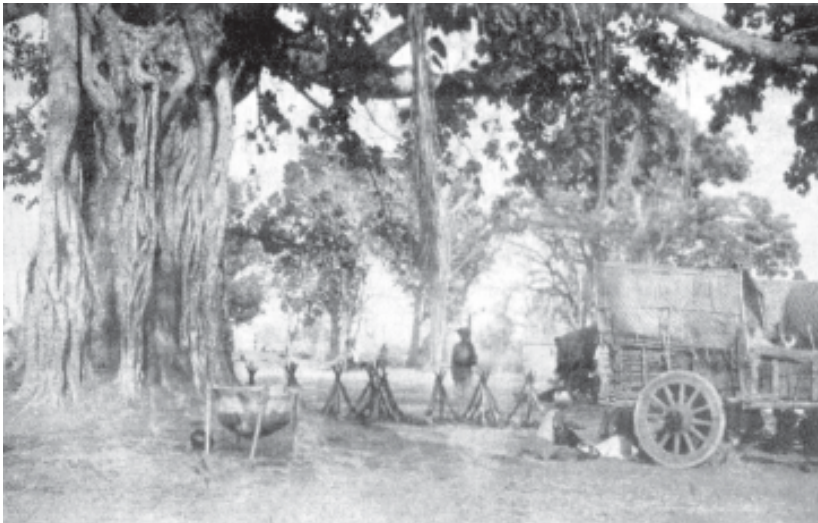
Fig.19 – Army camp in Bastar, 1910.

In 1947 Bastar kingdom was merged with Kanker kingdom and become Bastar district in Madhya Pradesh. In 1998 it was divided again into three districts, Kanker, Bastar and Dantewada. In 2001, these became part of Chhattisgarh. The 1910 rebellion first started in the Kanger forest area (encircled) and soon spread to other parts of the state.