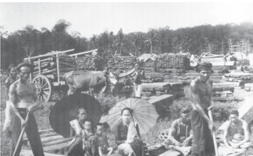
Fig.24 – Log yard in Rembang under Dutch colonial rule.

The Allies would not have been as successful in the First World War and the Second World War if they had not been able to exploit the resources and people of their colonies. Both the world wars had a devastating effect on the forests of India, Indonesia and elsewhere. The forest department cut freely to satisfy war needs.