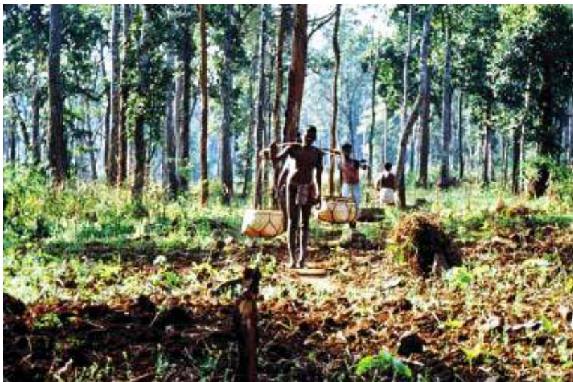
Fig. 14 – Bringing grain from the threshing grounds to the field.

The men are carrying grain in baskets from the threshing fields. Men carry the baskets slung on a pole across their shoulders, while women carry the baskets on their heads.