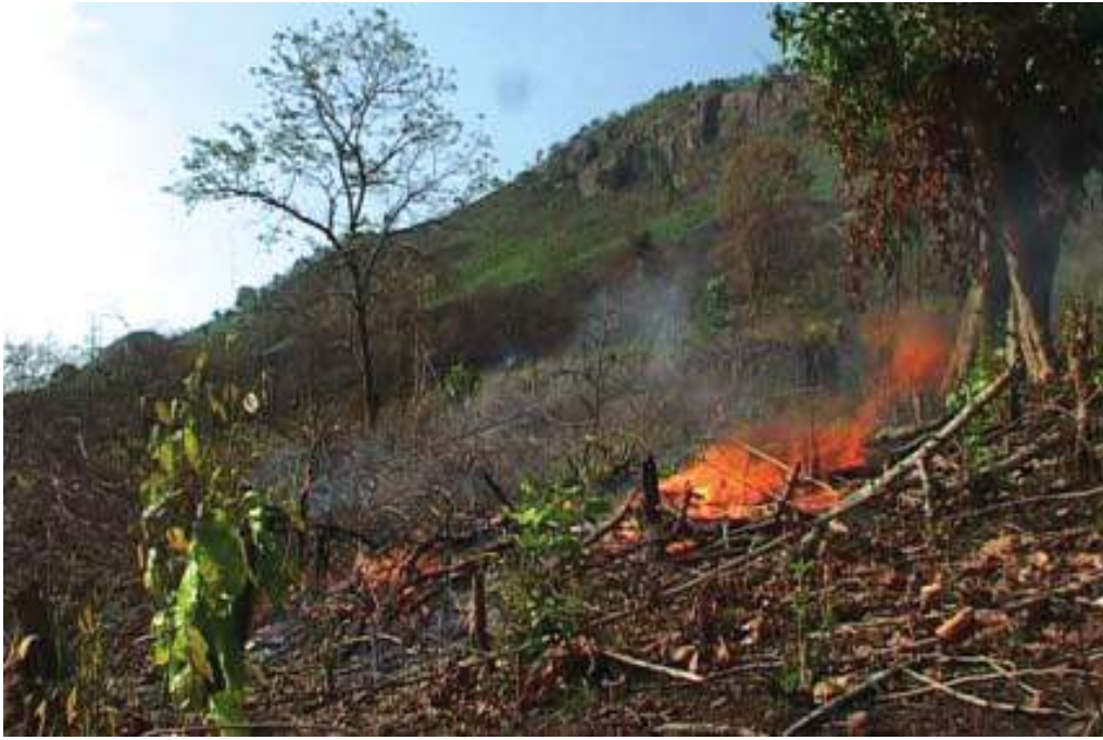
Fig. 16 – Burning the forest penda or podu plot.

In shifting cultivation, a clearing is made in the forest, usually on the slopes of hills. After the trees have been cut, they are burnt to provide ashes. The seeds are then scattered in the area, and left to be irrigated by the rain.