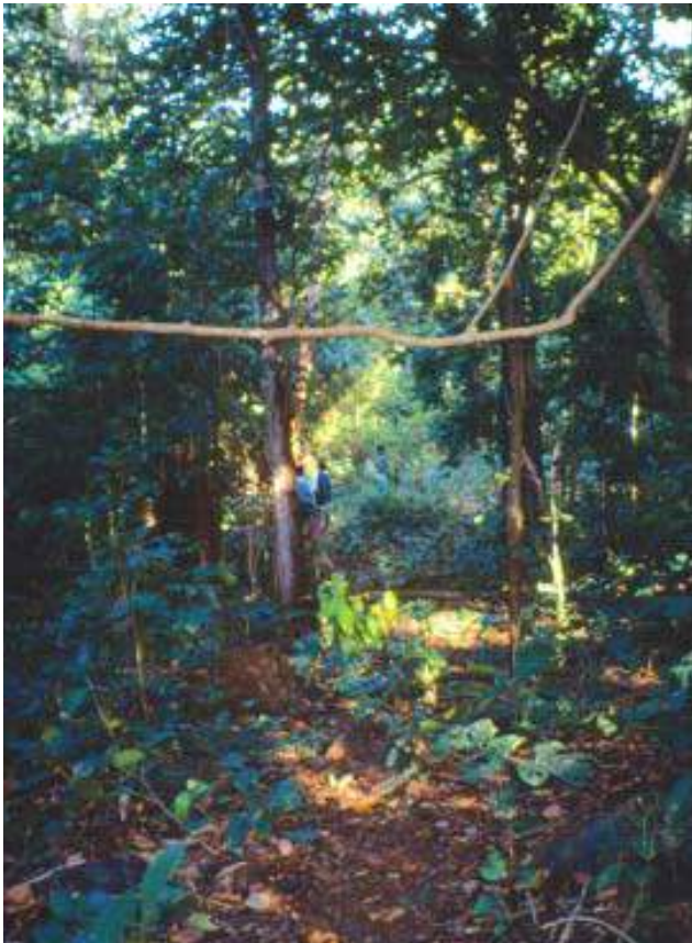
Fig. 1 – A sal forest in Chhattisgarh. Look at the different heights of the trees and plants in this picture, and the variety of species. This is a dense forest, so very little sunlight falls on the forest floor.

A lot of this diversity is fast disappearing. Between 1700 and 1995, the period of industrialisation, 13.9 million sq km of forest or 9.3 per cent of the world's total area was cleared for industrial uses, cultivation, pastures and fuelwood.