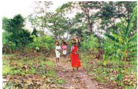
Fig.6 - Women returning home after collecting fuelwood.