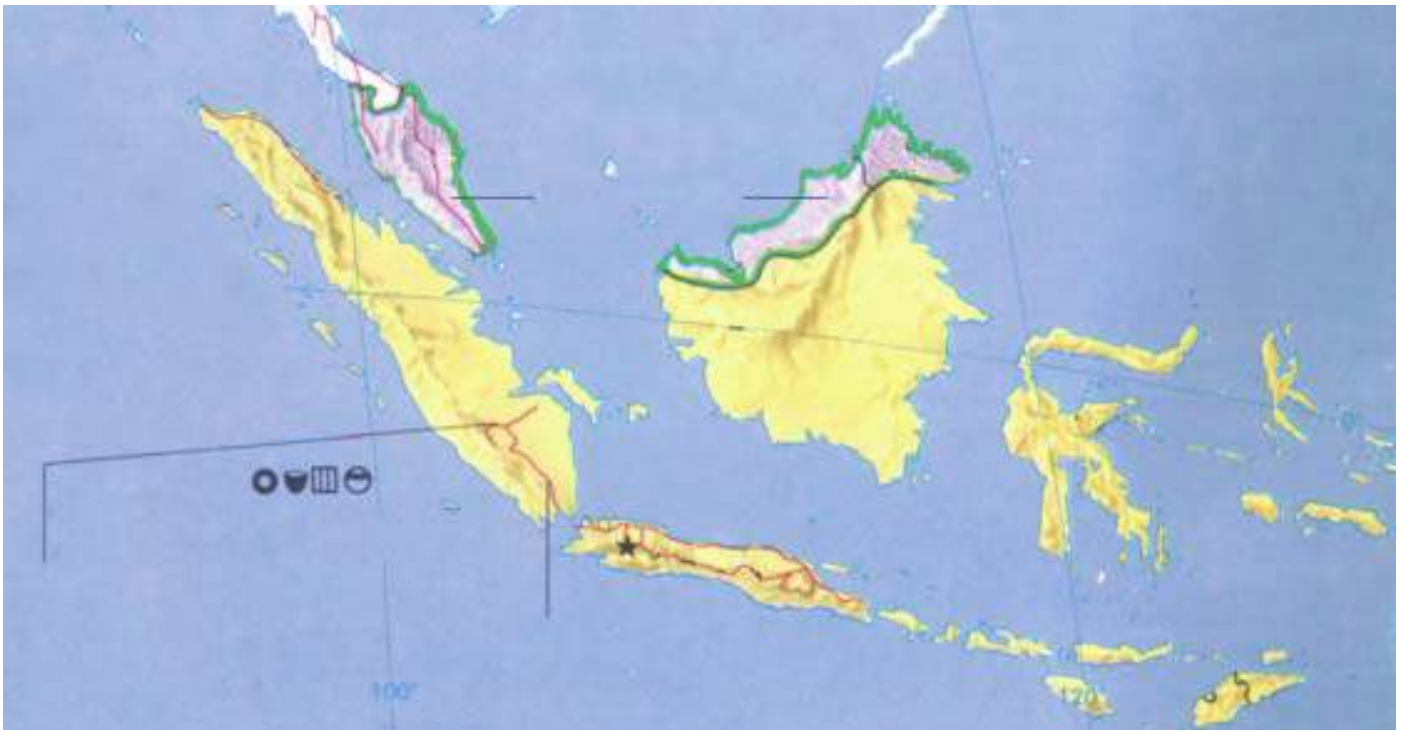
Fig. 22 – Most of Indonesia's forests are located in islands like Sumatra, Kalimantan and West Irian. However, Java is where the Dutch began their 'scientific forestry'. The island, which is now famous for rice production, was once richly covered with teak.

Dirk van Hogendorp, cited in Peluso, Rich Forests, Poor People , 1992.