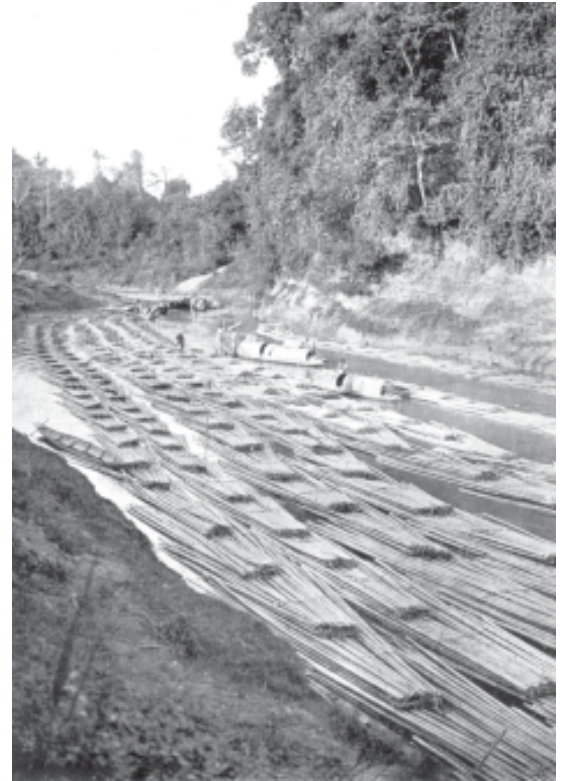
Fig.4 – Bamboo rafts being floated down the Kassalong river, Chittagong Hill Tracts.

From the 1860s, the railway network expanded rapidly. By 1890, about 25,500 km of track had been laid. In 1946, the length of the tracks had increased to over 765,000 km. As the railway tracks spread through India, a larger and larger number of trees were felled. As early as the 1850s, in the Madras Presidency alone, 35,000 trees were being cut annually for sleepers. The government gave out contracts to individuals to supply the required quantities. These contractors began cutting trees indiscriminately. Forests around the railway tracks fast started disappearing.