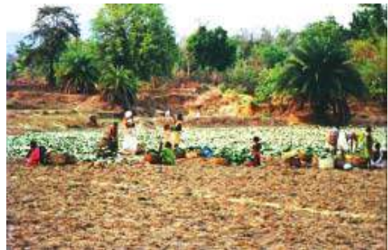
Fig. 13 – Drying tendu leaves.

The Forest Act meant severe hardship for villagers across the country. After the Act, all their everyday practices – cutting wood for their