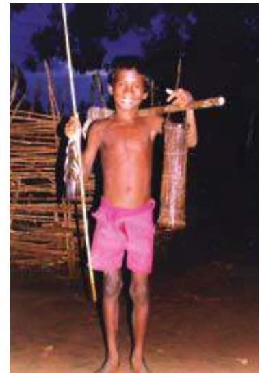
Fig. 17 – The little fisherman.

While the forest laws deprived people of their customary rights to hunt, hunting of big game became a sport. In India, hunting of tigers and other animals had been part of the culture of the court and nobility for centuries. Many Mughal paintings show princes and emperors enjoying a hunt. But under colonial rule the scale of hunting increased to such an extent that various species became almost extinct. The British saw large animals as signs of a wild, primitive and savage society. They believed that by killing dangerous animals the British