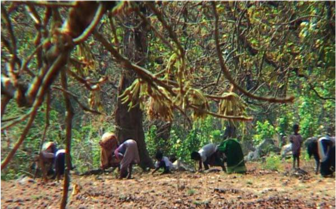
Fig. 12 – Collecting mahua ( Madhuca indica ) from the forests.

Villagers wake up before dawn and go to the forest to collect the mahua flowers which have fallen on the forest floor. Mahua trees are precious. Mahua flowers can be eaten or used to make alcohol. The seeds can be used to make oil.