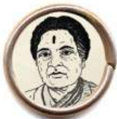
G. Durgabai Deshmukh (1909-1981)

born: Andhra Pradesh. Advocate and public activist for women's emancipation. Founder of Andhra Mahila Sabha. Congress leader. Later: Founder Chairperson of Central Social Welfare Board.