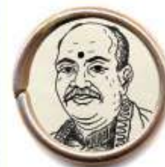
Shyama Prasad Mukherjee

(1891-1956) born:Madhya Pradesh. Chairman of the Drafting Committee. Social revolutionary thinker and agitator against caste divisions and caste based inequalities. Later: Law minister in the first cabinet of post-independence India. Founder of Republican Party of India.