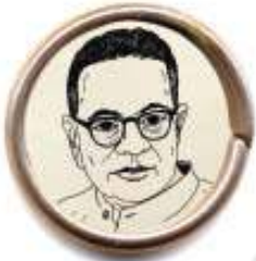
T.T. Krishnamachari (1899-1974)

(1888-1958) born: Saudi Arabia. Educationist, author and theologian; scholar of Arabic. Congress leader, active in the national movement. Opposed Muslim separatist politics. Later: Education Minister in the first union cabinet.