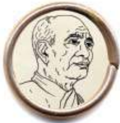
Vallabhbhai Jhaverbhai Patel

(1875-1950) born: Gujarat. Minister of Home, Information and Broadcasting in the Interim Government. Lawyer and leader of Bardoli peasant satyagraha. Played a decisive role in the integration of the Indian princely states. Later: Deputy Prime Minister.