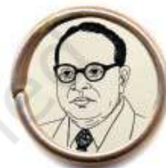
Bhimrao Ramji Ambedkar

(1887-1971) born:Gujarat. Advocate, historian and linguist. Congress leader and Gandhian. Later: Minister in the Union Cabinet. Founder of the Swatantra Party.