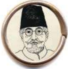
Abul Kalam Azad

(1888-1958) born: Saudi Arabia. Educationist, author and theologian; scholar of Arabic. Congress leader, active in the national movement. Opposed Muslim separatist politics. Later: Education Minister in the first union cabinet.